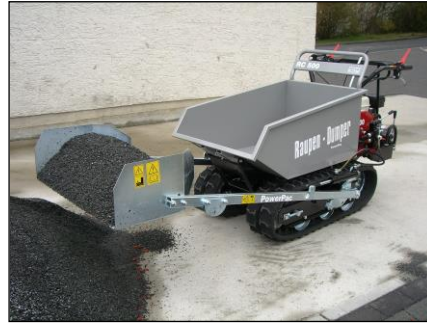
hydr. front loader