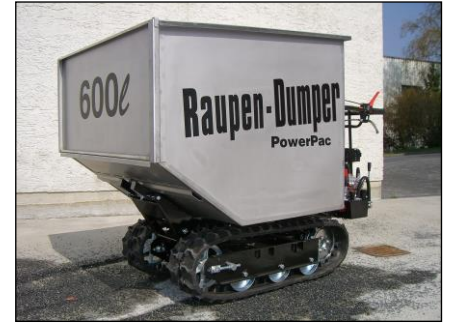
light cargo tray 600 ltr.